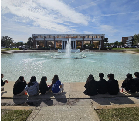
UCF campus tour and experience for our 8th graders!