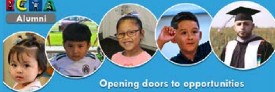
Opening doors to opportunities