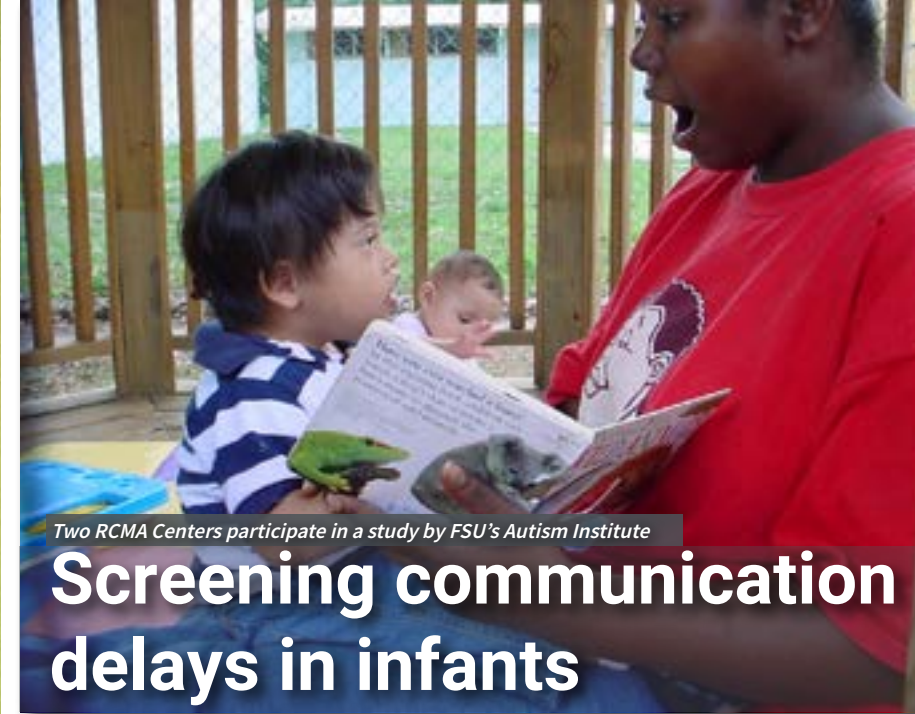
Two RCMA Centers participate in a study by FSU's Autism Institute